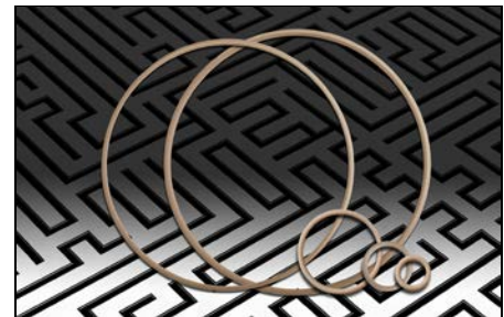
Kalrez® 9500 parts are based on a proprietary crosslinking system which is only available from DuPont.

Kalrez® 9500 exhibits excellent resistance to CVD and ash/strip process chemistry, i.e., ozone, ammonia and water vapor. It also offers outstanding thermal stability, very low outgassing and excellent mechanical strength and is well suited for both static and dynamic sealing applications. A maximum continuous service temperature of 310 °C is suggested. Kalrez® 9500 can also withstand short-term excursions up to 325 °C. Ultrapure post-cleaning and packaging is standard for all Kalrez® 9500 parts.