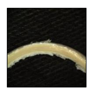
Incumbent FFKM Poppet Seal