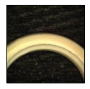
Incumbent FFKM Top Nozzle Seal