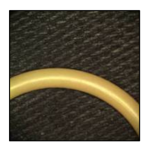
Kalrez<sup>®</sup> 9100 Poppet Seal

Figure 2. Kalrez<sup>®</sup> 9100 and incumbent seals after processing 5000 wafers. It was the research center's opinion that the Kalrez<sup>®</sup> 9100 seals could have continued to function beyond the scheduled PM cycle of 5,000 wafers.