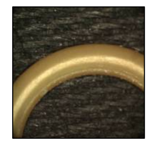
Kalrez<sup>®</sup> 9100 Top Nozzle Seal